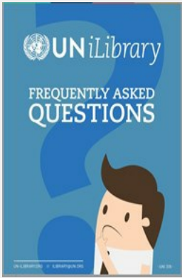
UN iLibrary One-pager - download the flyer