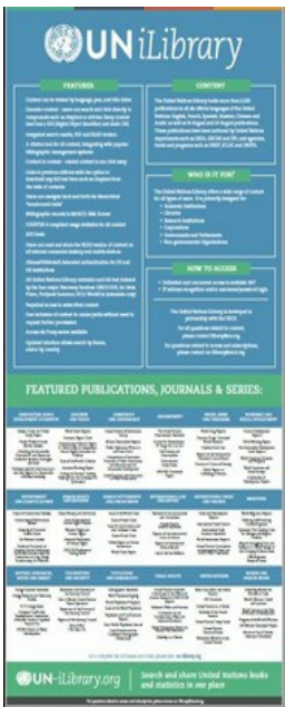
UN iLibrary Postcard - download