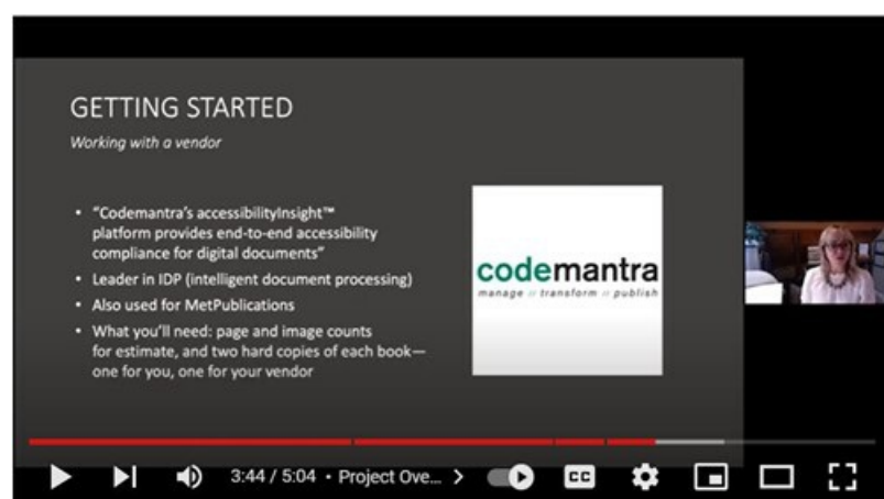
Museums Publishing Now 2021

Click below to see how Yale University worked with codemantra to digitise their physical publications and make them accessible and fully ADA compliant.