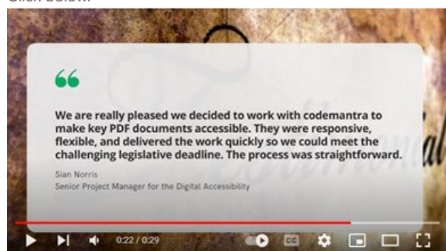
Case study of PSBAR compliance for University of Westminster -

This case study looks at how accessibilityInsight™ was at the heart of enabling the University of Westminster to attain PSBAR compliance. Click below: